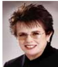
BILLIE JEAN KING